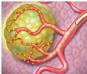
Liver tumours being treated with SIR-Spheres microspheres

SIR-Spheres microspheres are approved for the treatment of liver tumours that cannot be removed by surgery. These may be tumours that start in the liver (also known as primary